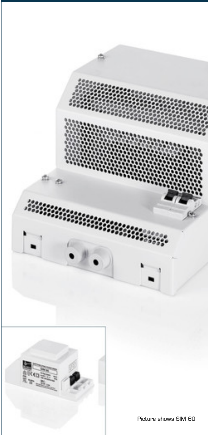
Picture shows SIM 60